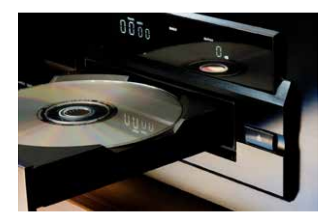
(A) a DVD player