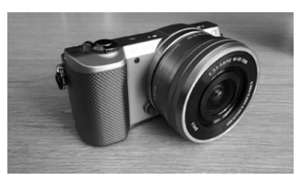
(C) a digital camera