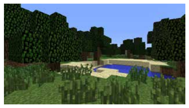
(D) a computer game