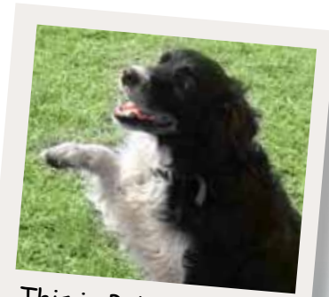
This is Bubbles.