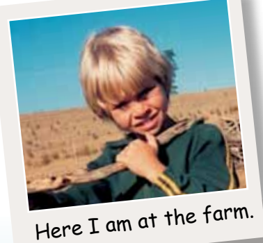
One Tree Farm