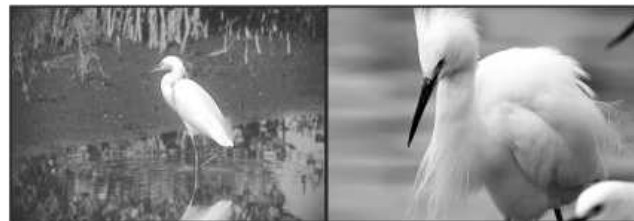
Snowy egret with feathers that are not fluffed