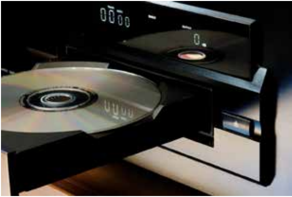
(A) a DVD player

1. Which of the following is an example of software?