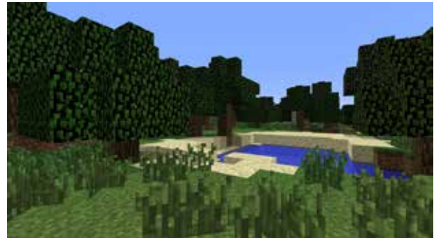
(D) a computer game