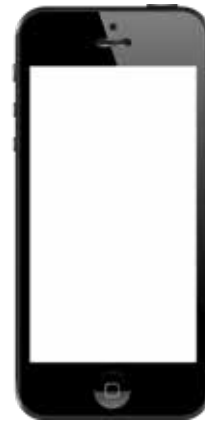
(B) a mobile phone