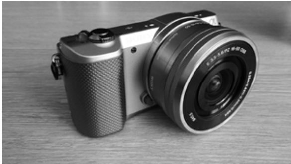
(C) a digital camera